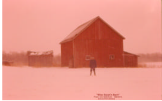
1960 VMS Moore5.jpg