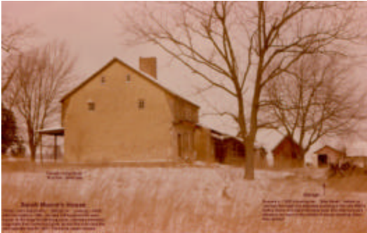
1960 VMS Moore3.jpg