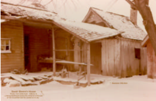
1960 VMS Moore2.jpg