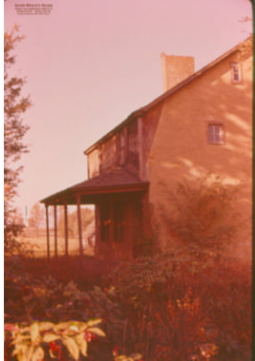
1959 VMS Moore6.jpg